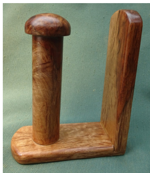
Left - Eric's tongue and groove wall panelling.