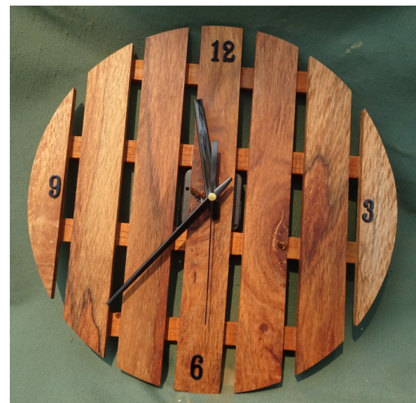
Above left - Gary Muldoon's plaque with leaves and gum nuts. The leaves are natural leaves glued onto a timber backing which he cut to the exact profile of the leaf, then lacquered to retain the natural colour and polished with a mix of natural wax and tongue oil to give a mat finish. Gary used a file to decorate the edge of the frame