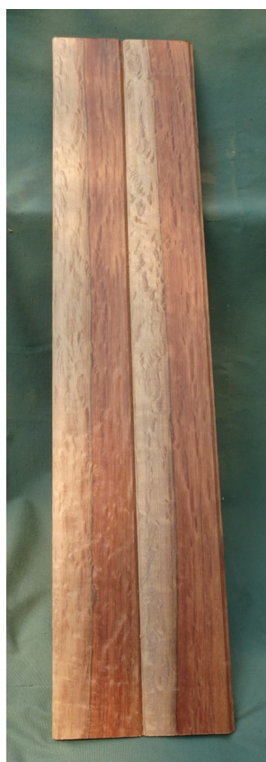
Right — Ann Salmon's toilet roll holder