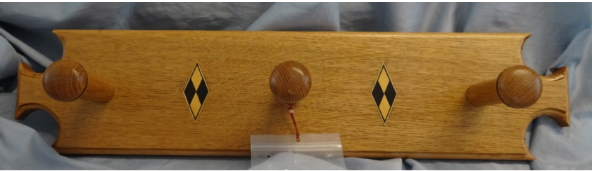
Below - Peter Brotherton's clothes hook (silky oak timber)