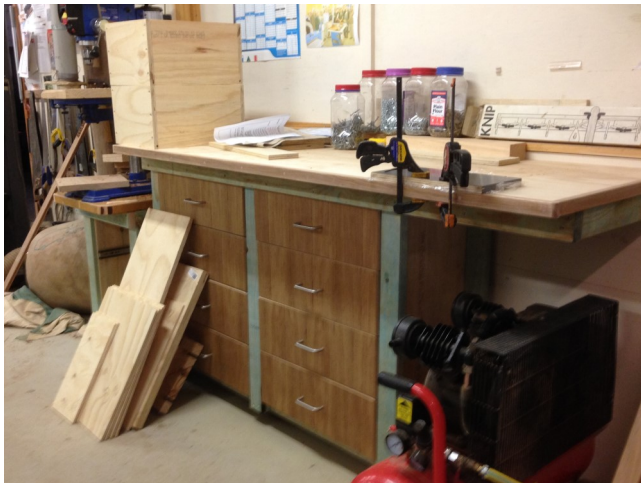
New internal workbench, still a work-in-progress