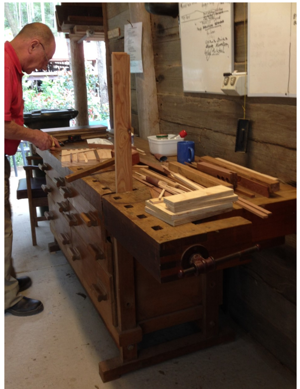
Old workbench relocated already being put to good use