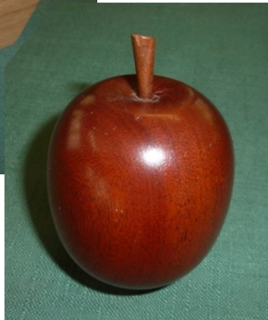
For this plum he used red gum